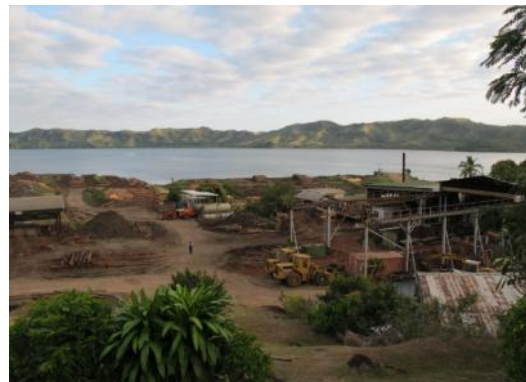
Left: Fiji Forest Industries' base near Labasa; FFI kindly provided information about their logging activities.

Finally, by working through the Protected Areas Committee, WCS will identify legislative gaps to be filled under the development of new protected area legislation. Fiji's Forest Policy already supports the development of PFEs in principle, though recognition of CFPs and RPZs needs further strengthening under Fijian law.