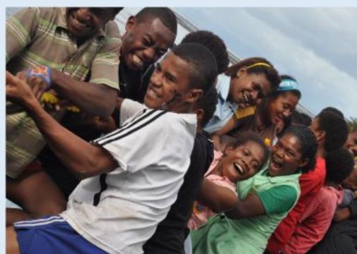
Above: Muscle power in the tug-of-war.

Dawasamu district on the northeast coast of Viti Levu has been a site for researchers at the Institute of Applied Science (University of the South Pacific) and part of the Fiji Locally Managed Marine Area network since 2005. The district organised